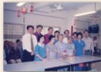
2002 LCS-SLEC 1st Anniversary Celebration

The LCS-SLEC partnership started since 2000