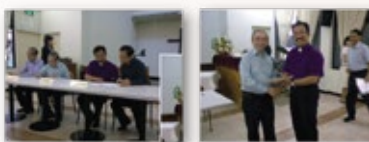
2011 LCS-SLEC MOU Renewal