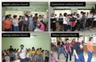
LCS-SLEC Memorable Moments Ministry by LCS Members