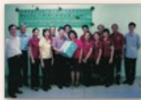
2008 LCS-SLEC Christmas Celebration