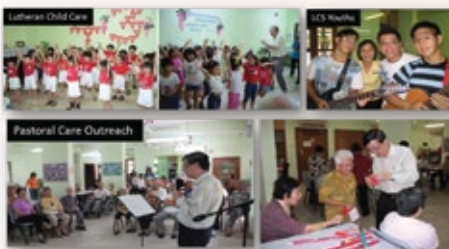
LCS-SLEC Memorable Moments Intergenerational Engagements by LCS Members