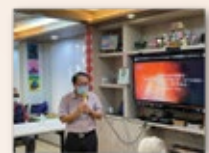
2022 SLEC Presentation at LCS Church Leaders' Meeting