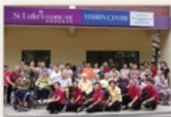
2009-2010 LCS-SLEC Memorable Moments Providing social and supportive care to elders and caregivers in the north