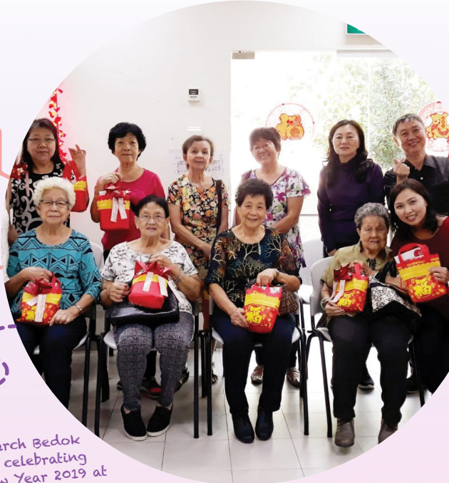
Sion Church Bedok members celebrating Chinese New Year 2019 at SLEC Changkat Centre.

Sion Church Bedok has been a dedicated partner of Tung Ling Elder Care Centre in Tampines since 2000. In 2005, when the management of the centre was transitioned to St Luke's ElderCare, the church continued its support under the new name, SLEC Tampines Centre. Over the years, the church's outreach has extended to include SLEC Changkat Centre in 2013, fostering a lasting connection with the elderly residents at both locations.