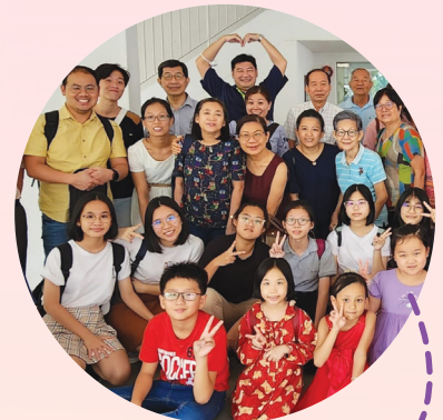
Sion Church Bedok members during Christmas at SLEC Changkat Centre in 2022.