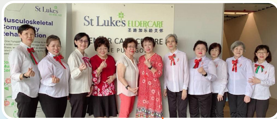
The COOS Connect Teochew Gospel Song Group at SLEC Senior Care Centre @ One Punggol.

Support our work through a donation. www.slec.org.sg/giving/